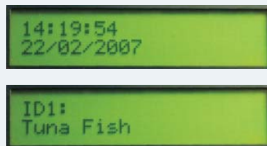
Realtime information and data entry