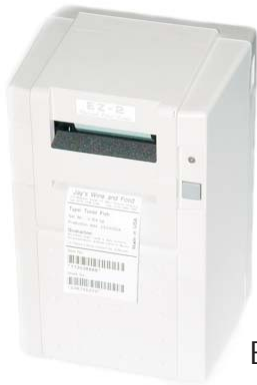
EZ-2P label printer