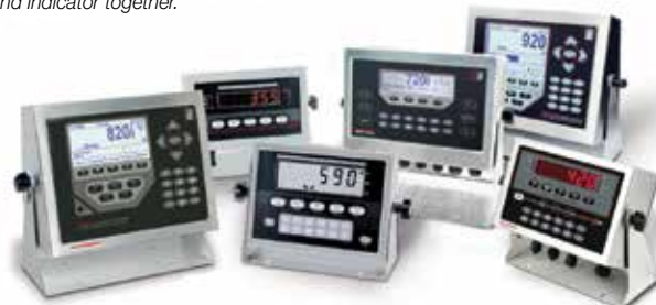
Choose from a versatile line of digital weight indicators.

Each scale is corner calibrated at the factory. Distributors must calibrate scale and indicator together.