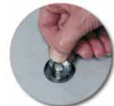
Dual corner locks secure the deck to the base for safety, durability, and convenience.