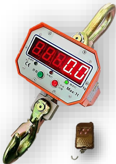
Sample picture for reference only