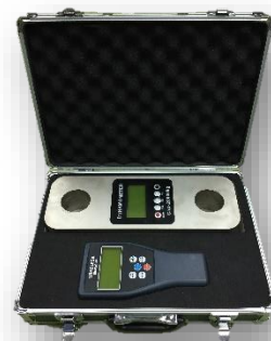
Come with carrying case